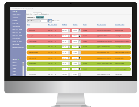
See your runs side-by-side, then 'drag and drop' your trips.