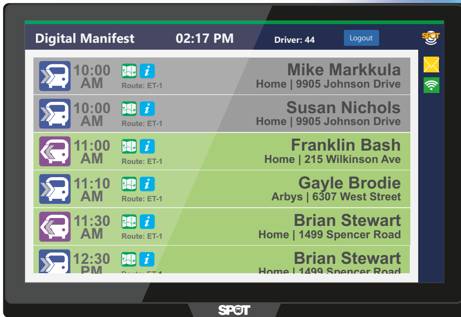
MDT-based digital manifest eliminates manual processes and improves accuracy.