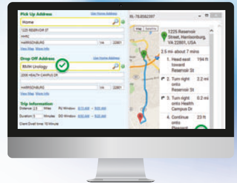
Calculate drive times with embedded Google® Maps™.