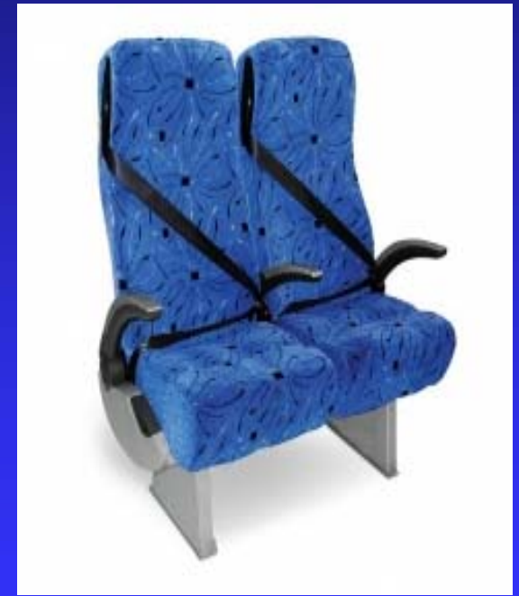
AMAYA Torino G